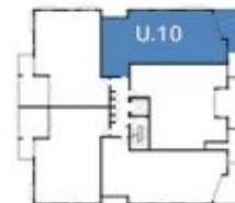
LVL 2 KEY LEGEND (NOT TO SCALE)