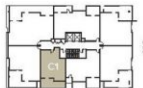
KEY LEGEND (NOT TO SCALE)