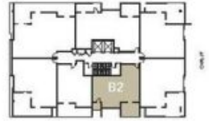
LEVEL 10 KEY LEGEND (NOT TO SCALE)