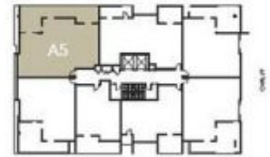
LEVEL 10 KEY LEGEND (NOT TO SCALE)