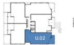
LVL 1 KEY LEGEND (NOT TO SCALE)