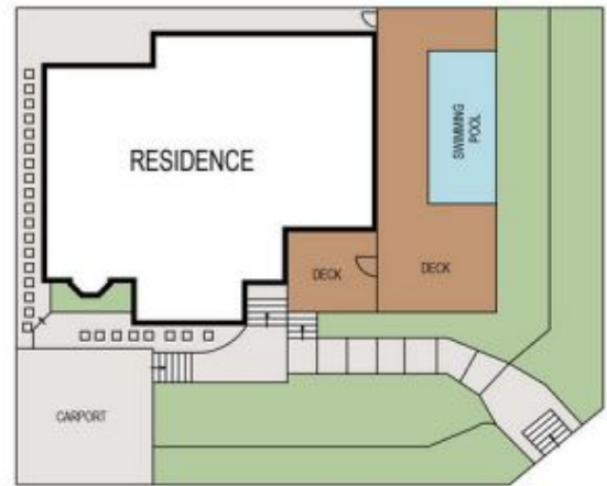
SITE MAP (NOT TO SCALE)