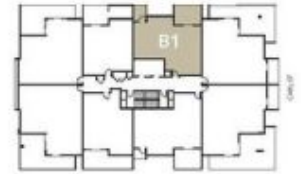
LEVEL 3-8 KEY LEGEND (NOT TO SCALE)