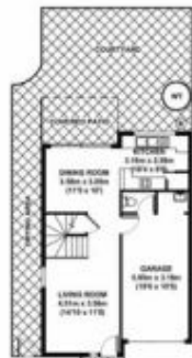
FIRST FLOOR GROSS AREA 365 SQ. M